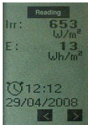
Time-recorded stored values